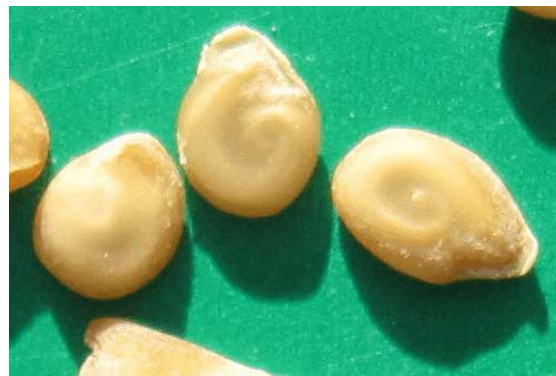
Seed after treatment with 5000 ppm chlorine for 60 minutes, showing removal of fuzz from seed coat. Embryos are visible through bleached, disinfected seed coat.

A 42 page report “TOMATO SEED DISINFECTION WITH CHLORINE” is available on our website at www.tomatosolutions.ca