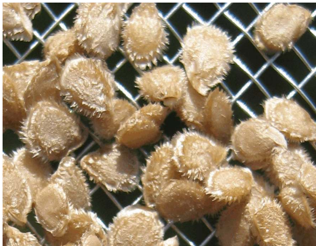
Untreated seed showing fuzzy surface ideal for harbouring bacterial and viral pathogens.