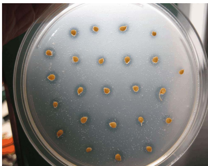
Effect of chlorine residue on dried seed on growth of canker bacteria. The clear zone around each seed. indicates bacterial growth inhibition.