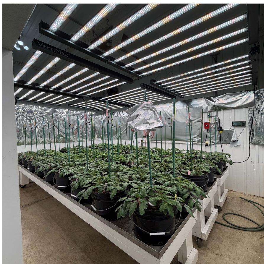
GROWTH CHAMBER FOR PRODUCTION OF NEW HYBRIDS